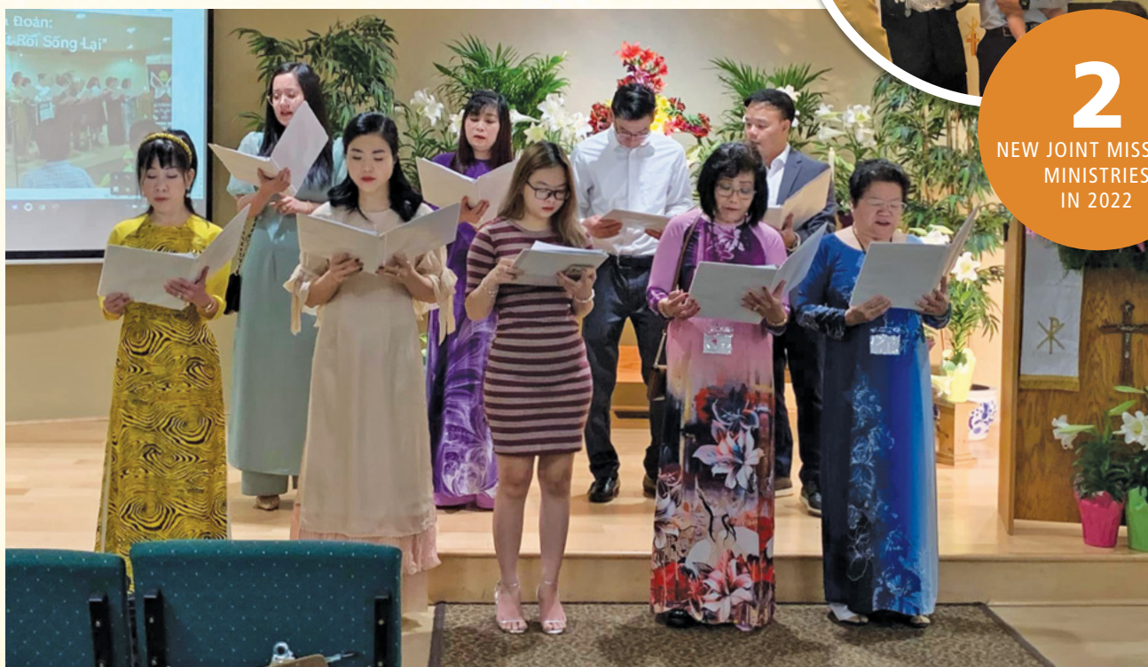
A choir from Peace in Jesus Vietnamese Lutheran Church in Boise, Ida. , sings for Easter worship in April 2022.