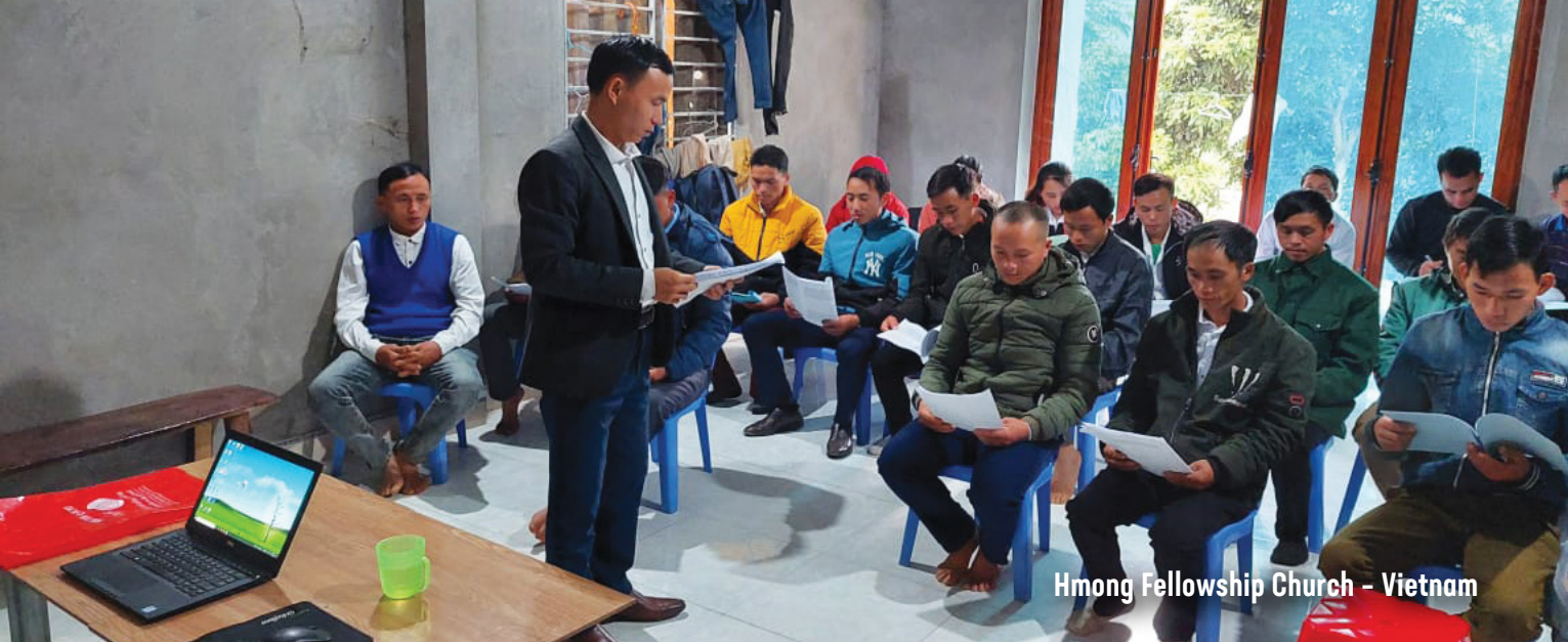
Hmong Fellowship Church - Vietnam