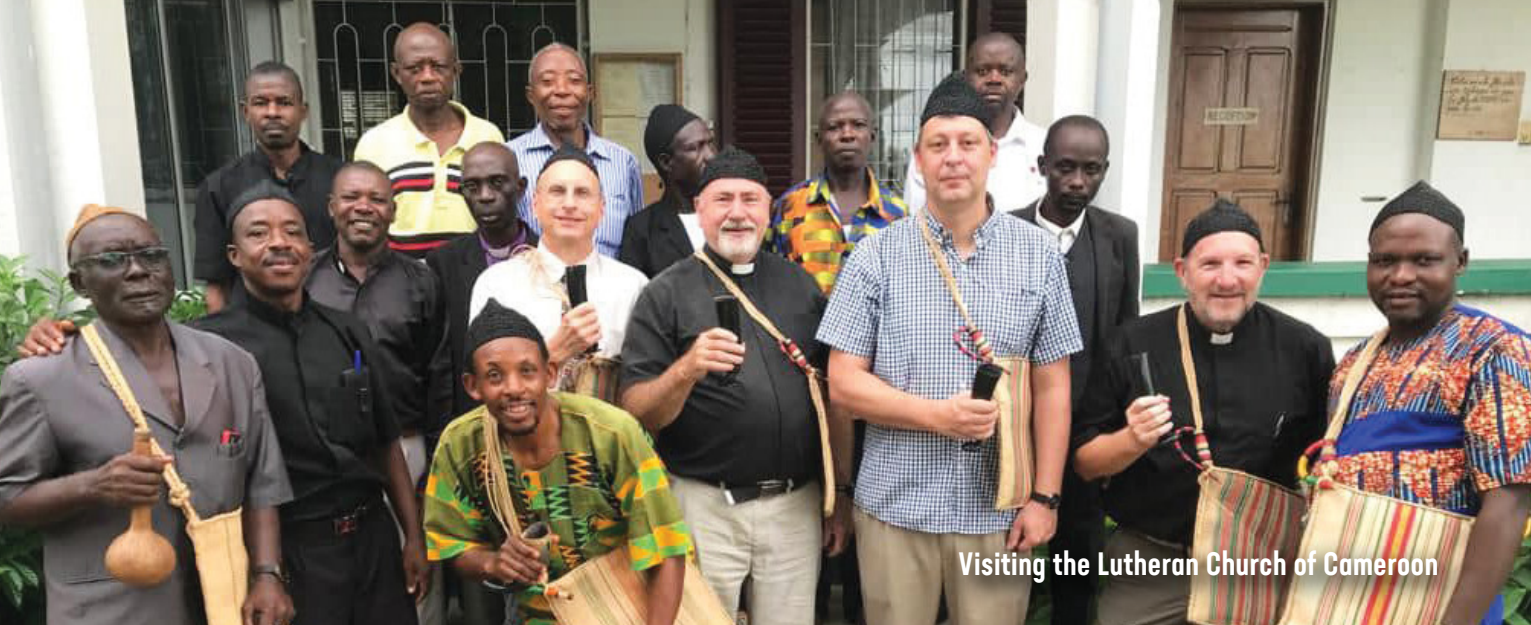
Visiting the Lutheran Church of Cameroon