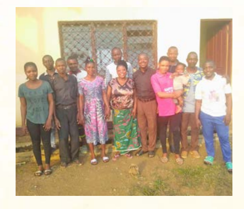
The Lutheran Church of Cameroon has a great tradition of bringing students' wives onto campus to be with their husbands and study Scripture together, as well as develop relationships with other Lutheran pastors' wives.